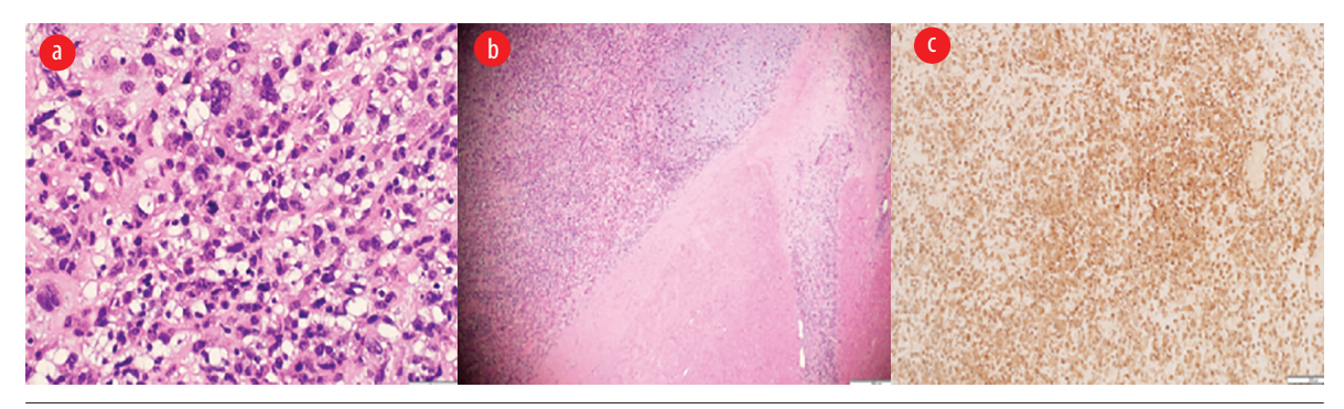
Figure 4: (a) Sheets of malignant cells with marked nuclear pleomorphism and scattered mitotic figures. (b) The malignant tumor invades the myocardium. (c) Immunohistochemistry profile shows positivity for mouse double minute2.

Histologically, intimal sarcoma is composed of atypical spindle cells that have variable degrees