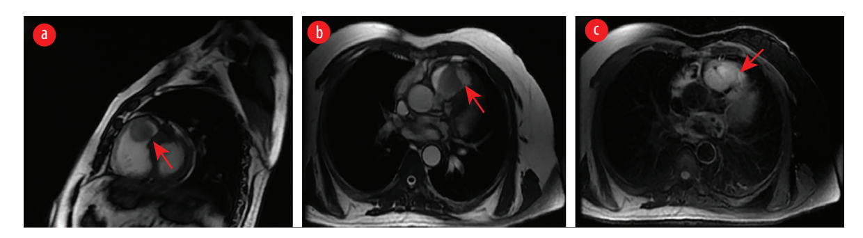
Figure 1: ( a , b ) Cine steady-state free precession magnetic resonance imaging showing a well-defined isointense mass located within the right ventricular outflow tract (red arrows). ( c ) The mass is hyperintense in T2-weighted image.

left ventricular hypertrophy and a small pericardial effusion. Otherwise, there was no evidence of valvular disease and the ejection fraction was normal (65.0%). In view of the echocardiogram findings, a pulmonary angiography computed tomography (CT) was requested, which confirmed the presence of a RVOT well-defined hypodense mass extending to the main pulmonary trunk. The impression was a pulmonary embolism versus a myxoma with pulmonary embolism favored over a tumor.